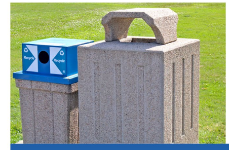
Trash / recycling receptacle $950