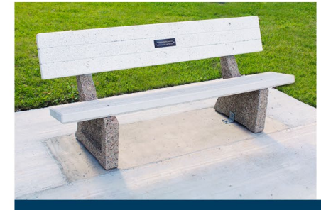
Bench with plaque $1500