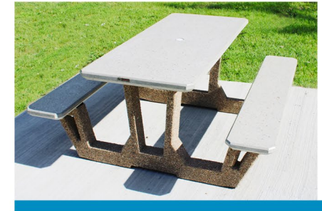
Picnic table $1800

Park benches, picnic tables, trash and recycling receptacles are some items that help keep our parks inviting and clean.